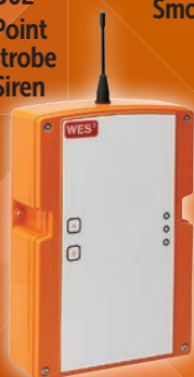
50-316 Link Unit (signal booster)