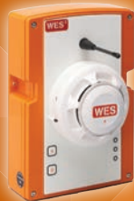
50-310 Dust Resistant Smoke Sensor