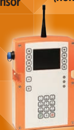
50-322 Connect Base Station 4g communicator