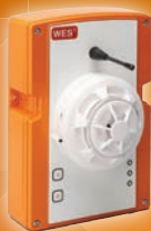
50-306 Heat Sensor