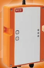
50-320 Interface Module