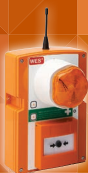
50-302 Call Point with Strobe and Siren